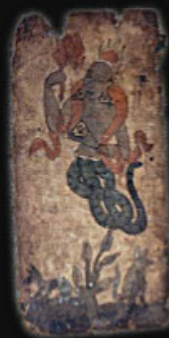
占卜纸牌画 Ritual Divination Cards