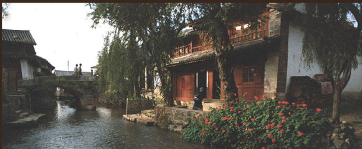
The Old Town of Dayan

Notwithstanding the fact that Dongba culture is essentially of limited local influence, its preservation is a task of international significance. By including the historic town center of Lijiang among the protected UNESCO World Heritage Sites in 1997, the first step to preserve the ancient architecture of the Dongba heartland has been undertaken.