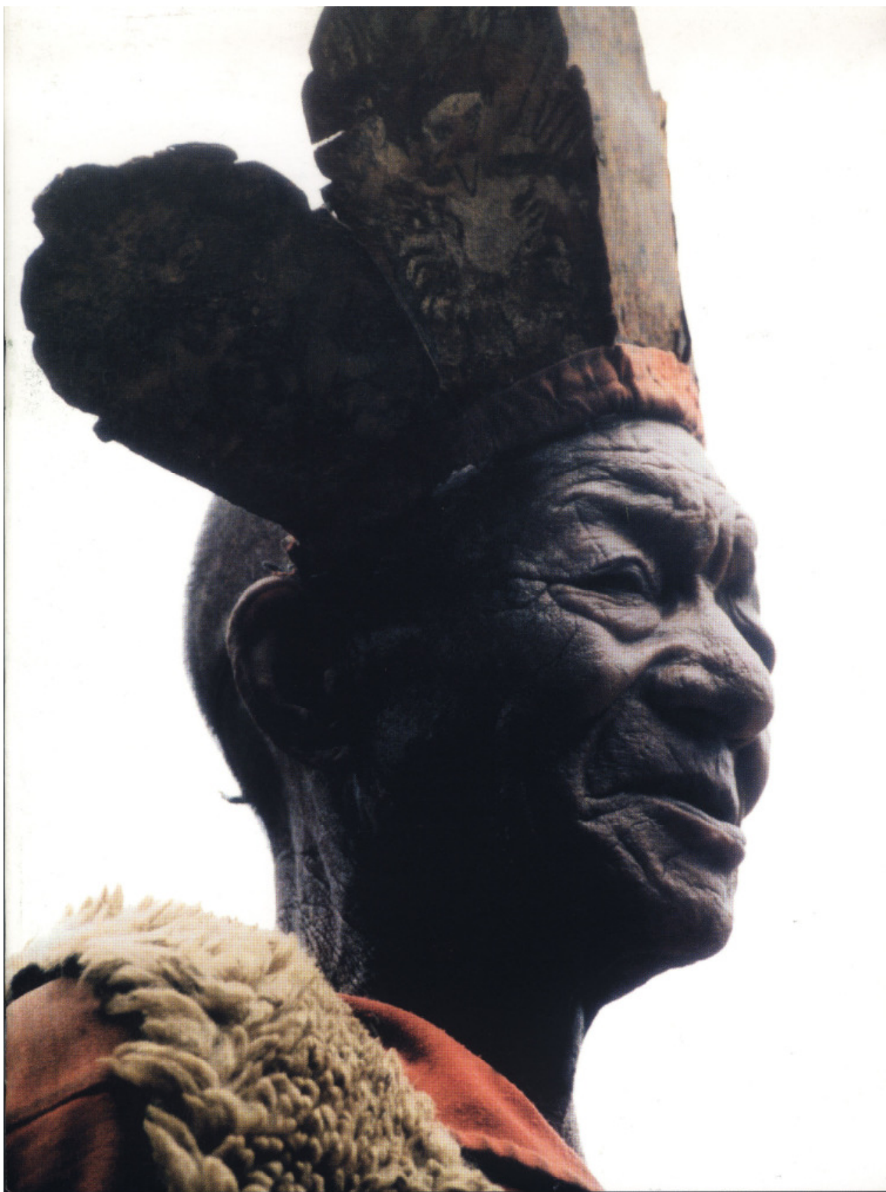
东巴祭师 Dongba Shaman