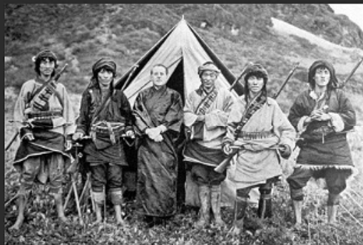
Dr. Rock and his Naxi guards 洛克与他的纳西族护卫队

Dongba books, originally written with ink-filled bamboo pens on tree bark, are now mainly made of handmade paper. Since the late 19th century, when a French missionary brought the first specimens to the attention of the West, Dongba scriptures have aroused international attention. It is estimated that about 30,000 volumes still exist, around 12,000 of which have been acquired by international academic institutions and museums. Of these, 3000 can be found in the American Library of Congress.