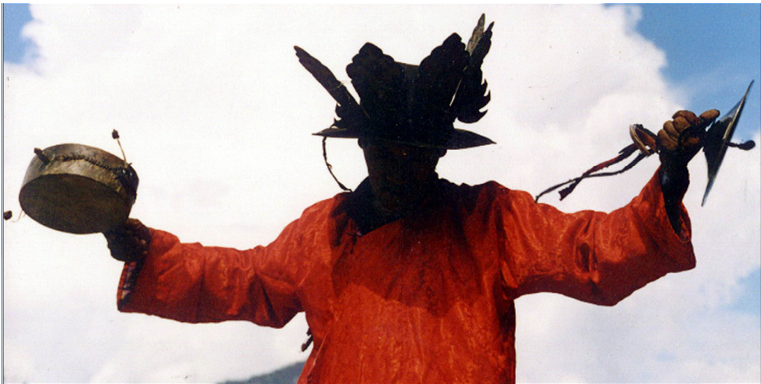
The Dongba priest of the Naxi People performs a dongba dance at the ceremony