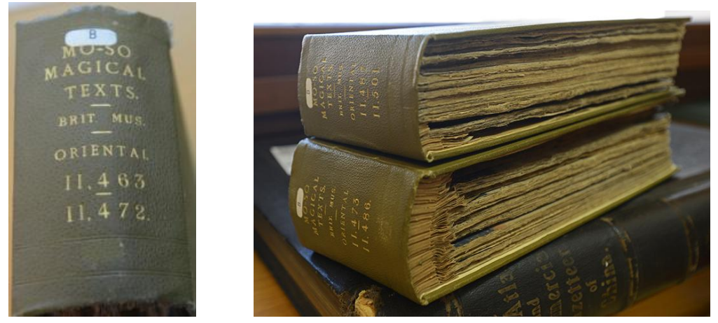
One scripture of the Dongba manuscripts collections in the British Library, and Its library collection of Dongba manuscripts digital versions have been provided free of charge to the China National Social Science Fund Key Project in 2013