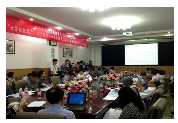
Meeting site

The morning of June 22, 2013, the National Social Science Fund Key Project report of feasibility study meeting was held in Beijing Information Science and Technology University. The anthropology, Ethnology Experts and scholars and project group members of nearly a hundred people attended the meeting.